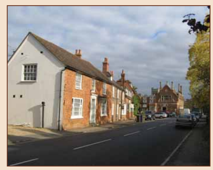
View east along Leighton Street to the Town Hall