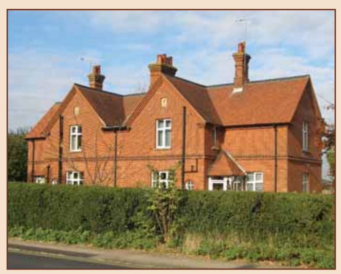
Leighton Street - Bedford Estate Cottages

Leighton Street is the historic route which runs west from the centre of Woburn towards Leighton Buzzard. The street, at the westernmost reaches of the conservation area, has the qualities of a rural lane, but becomes increasingly built up toward the village centre, as the street broadens out to the Market Place. The lane has an open appearance, with houses typically set back from the pavement line behind large front gardens. Hedges create a 'green corridor' which runs through to the village centre; the hedges provide a unifying link along the street between areas where they bound rural fields, and the stretches where they contain front gardens.