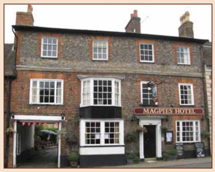
Magpies Hotel, Bedford Street

centuries, and it was also on the drovers' route (Caswell Lane). The market charter was granted in 1242. The town was an important stop for coaches during the 18th century; it was the first town on the new Bedfordshire turnpike system in 1706. At its peak in the mid-19th century the town had around 30 inns. It also had the first 24 hour post office outside London. However, with the arrival of the railway in Woburn Sands in 1846, much of the commercial and through traffic ceased.