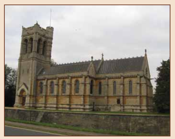
Church of St Mary, Park Street - a dominant landmark

important focal point in views from the village centre eastwards, and provides a key visual reminder of the grandeur of Woburn Abbey beyond.