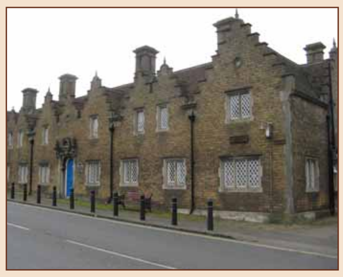
Staunton House, Bedford Street

Red brick is the prevalent visible historic building material, although many of the 18th century and earlier structures are of timber-framed construction. Roofs are of plain clay tiles, although these have been regrettably gradually lost to replacement concrete tiles. Woburn is notable for the high quality of the brickwork; Flemish bond is prevalent, with flared headers used on some buildings to add decorative interest, while there are also examples of English bond and the costly display of header bond. Fine rubbed and gauged brickwork is visible above many of the window heads, while on other buildings such gauged brickwork articulates elevations with pilasters, cornices and aprons below the windows, for example on nos. 11 and 12 Market Place. Staunton House (nos. 2-8 and nos. 9-18 Bedford Street) are key gateway buildings at the northern entrance to the conservation area; these 19th century former almshouses are notable for the use of yellow brick and the decorative display of Jacobethan detailing. Built in 1850 by the 7th Duke of Bedford, the almshouses had been founded by Sir Francis Staunton in his will in 1635. The use of brick creates a harmonious, unified appearance to the streetscene, which could be disrupted if the brickwork is painted or rendered. However, there are a few examples of historic stucco render in the conservation area, such as Lion Lodge on Park Street.