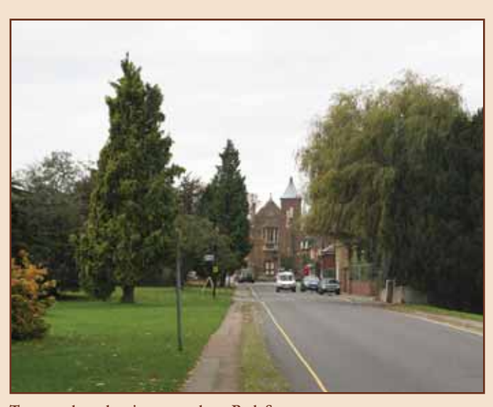
Trees enclose the view west along Park Street

Park Street comprises part of the historic route between Woburn and Froxfield; this public route now bisects Woburn Park. It has a spacious, green character formed by the wide roadway which is bordered by deep grass verges. A number of mature trees are irregularly placed along the route. The street is little encumbered by built development, and has a character more directly allied with the formal parkland to the east.