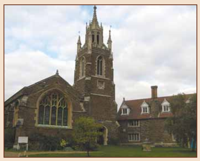
The Old Church Heritage Centre