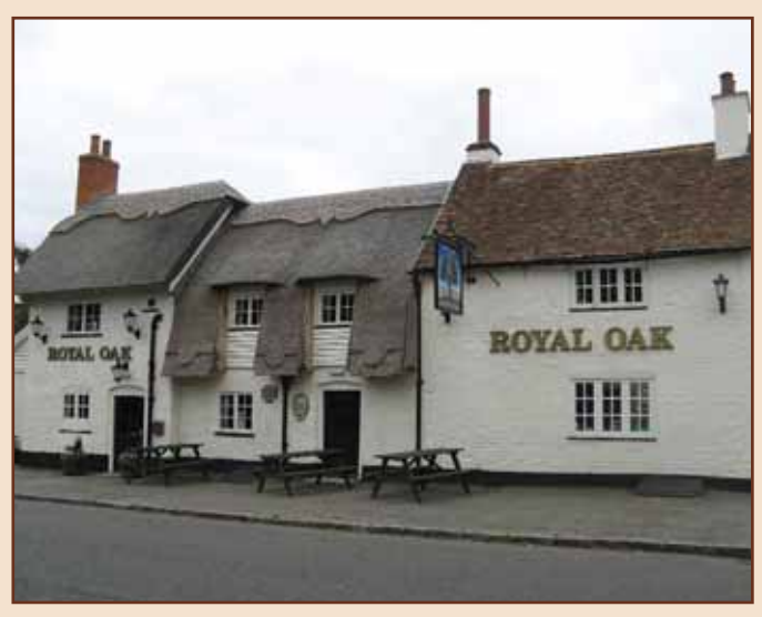
Royal Oak public house, George Street - thatch, old tile and lime plaster

The streets are bound by tight-knit development set at back-of-pavement line, which enclose views through the village. These built-up near-continuous frontages frame views along the street, and in many instances terminate a view where the street turns. These deflected views of short sections of townscape introduce an unfolding panorama of visual interest with movement through the village. Attractive glimpses through to the intimate courtyards and gardens at the rear of plots are obtained through the numerous former carriage arches. Woburn became an important staging post on a countrywide network and at its peak had around 30 inns; the road from Hockliffe to Woburn was turnpiked in 1706 and this was extended to Woburn Sands in 1727. At the junction of High Street and George Street, the road widens out at a crossroads, with the principal route to Leighton Buzzard running to the west. This widening of the street encompasses the cobbled Market Place, 'The Pitchings', and two areas of open green space; one of these gardens contains the War Memorial erected in 1920, of a Portland stone cross mounted with a bronze sword.