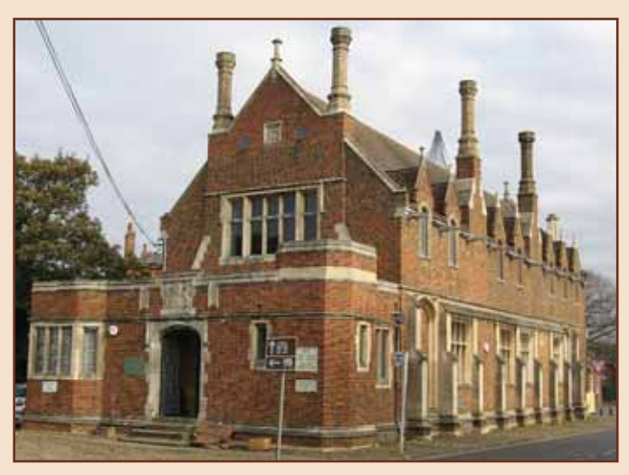
Town Hall - a key landmark building at the crossroads

articulated by a different window design at each level; the windows all feature Gothick pointed-arch glazing bars. No. 19 Market Place (grade II*), was reworked in 1820 for the 6th Duke of Bedford by George Maddocks, who designed new shop windows for the draper then occupying the building; the projecting bowed shopfront occupies the full ground floor, and with its elaborate glazing patterns, adds an element of decorative delight to views of this part of the village.