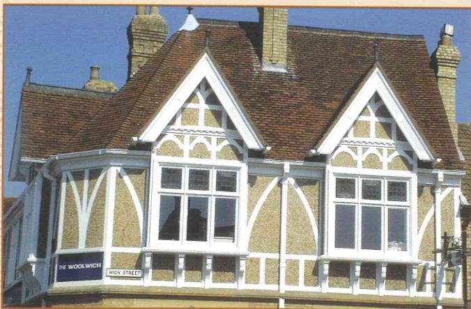
1 High Street (The Woolwich).

On the north east side of the roundabout, No.'s 2, 2A and 4 St. Neots Road and No. 18 Market Square form an important group. Collectively, they make a positive contribution to the Conservation Area. For instance, No. 2 has margin light glazing and No. 4 has quoins, doorcase and margin lights. No. 18 is also impressive with its red brick bays, fanlight and delicate dog-toothed dentil course under the eaves. Together they form the town centre front of the Jordan's Yard site, their retention is important and their restoration to good condition would be an important step towards improvement of the area.