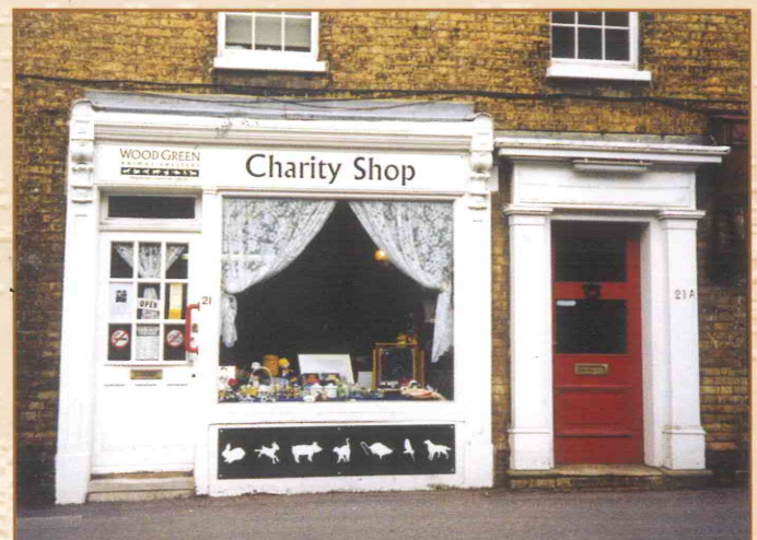
Remains of an historic shopfront at No. 21A High Street.

Many buildings have historic shop fronts, which should be preserved and could be used as a template elsewhere. Good examples include, No. 21A High Street and the brackets above the existing shop front at No. 25.