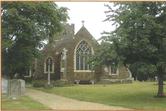
The churchyard forms a break in the street frontage. When seen from a distance, the pollarded limes continue the line of the street.

The character of Sandy Conservation Area is partly defined by its setting: areas outside the conservation area but having a direct impact on it. These include the semi-natural environment of the river and meadows; the sandhills forming an elevated back drop to the town; and the industrial backland of the former Jordans Yard and its outbuildings.