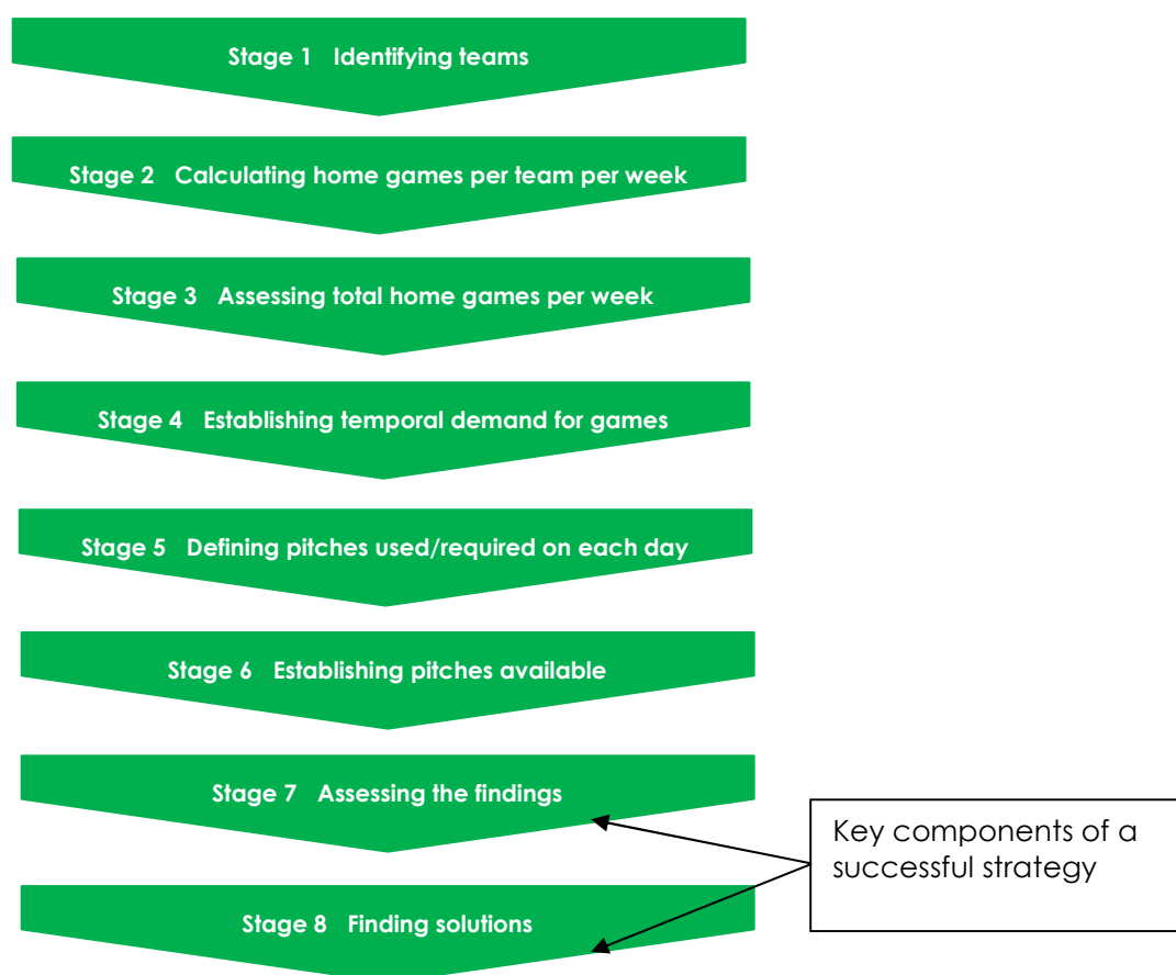
Figure 2.1 - The key stages of the Playing Pitch Methodology (TaLPP)