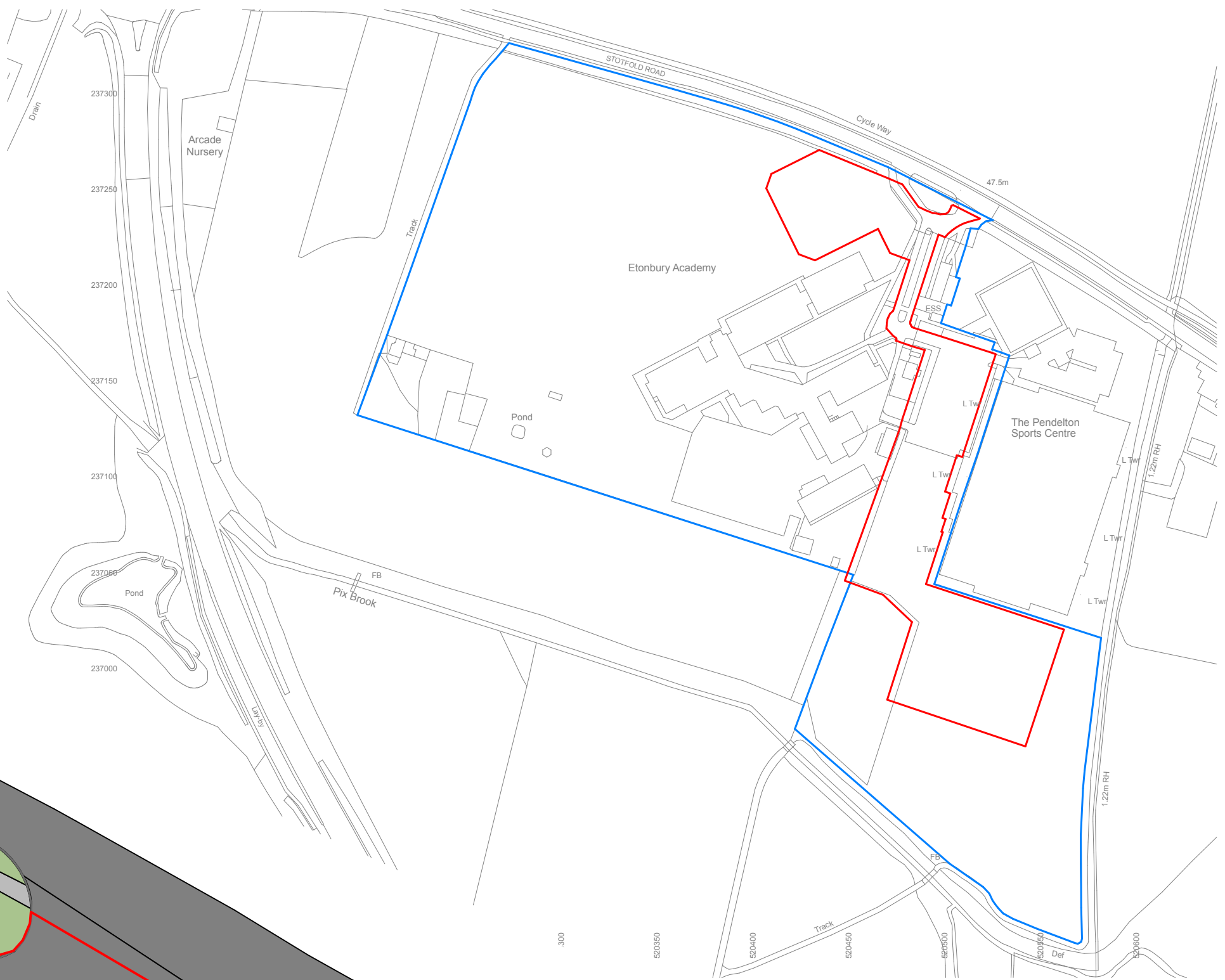
LOCATION PLAN - 1:2500