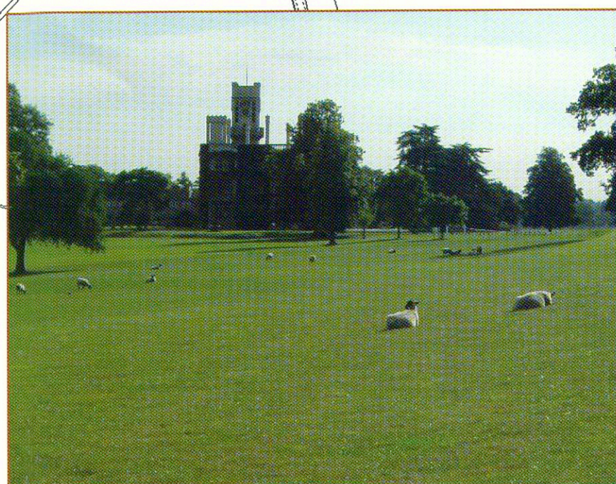
Old Warden Park