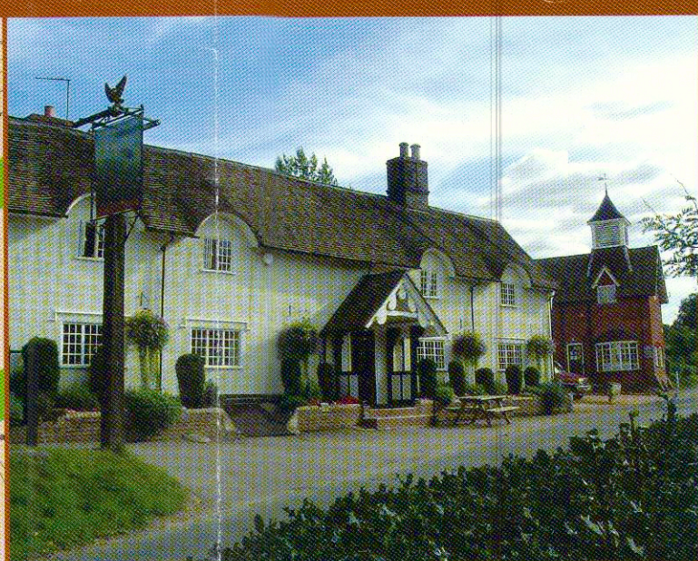
Hare and Hounds Public House and Post Office