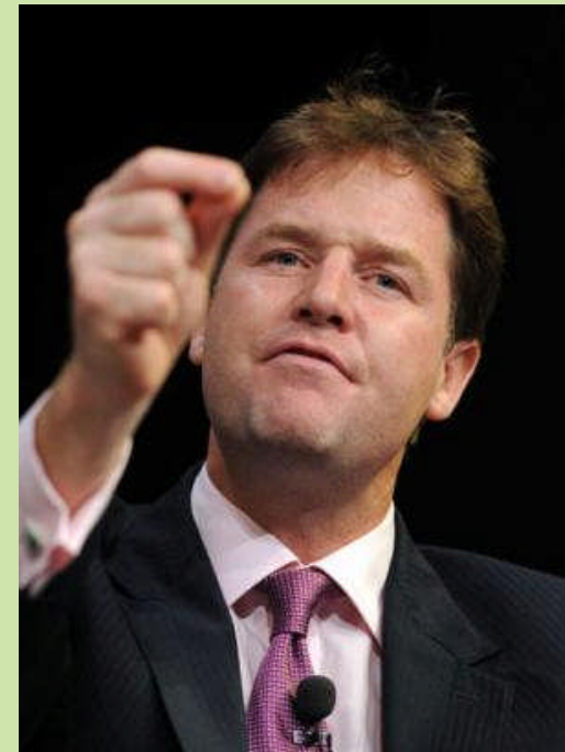
Nick Clegg Leader of Liberal Democrats

Quote: Liberal Democrat Policy Statement