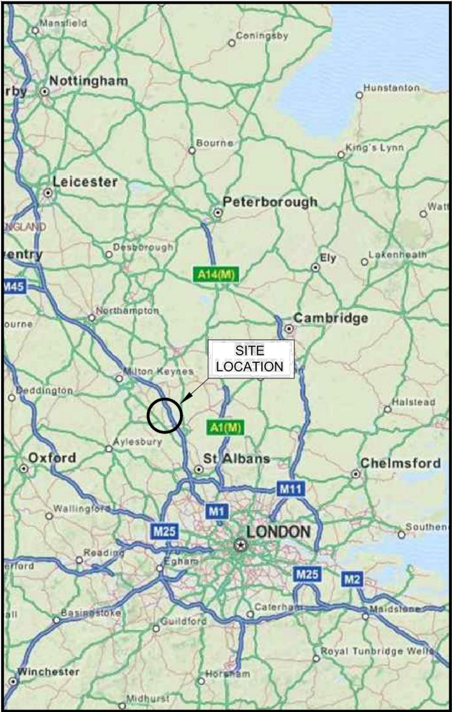
Location Plan Scale NTS