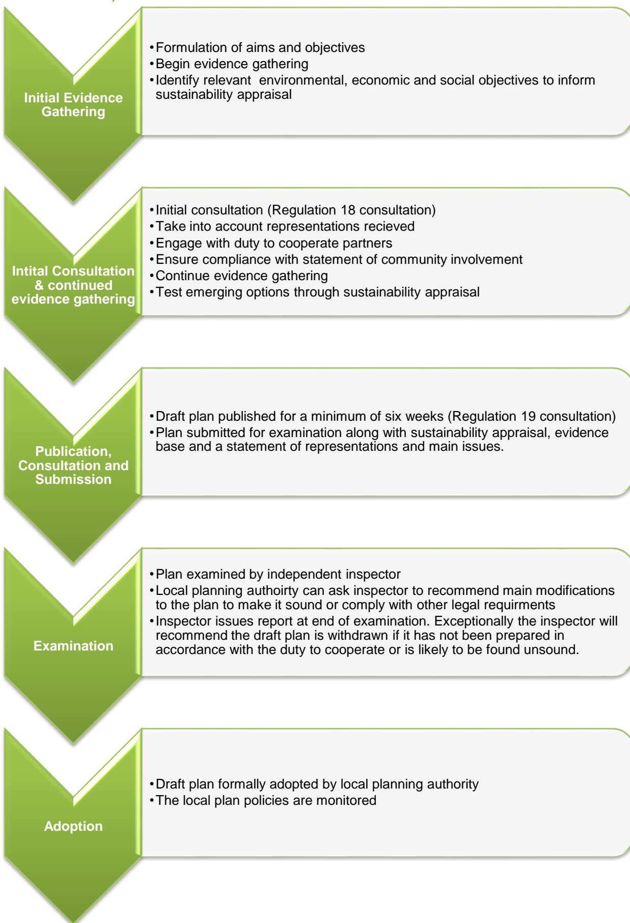
Figure 1 : Summary of local plans process (adapted from Planning Practice Guidance on Local Plans)