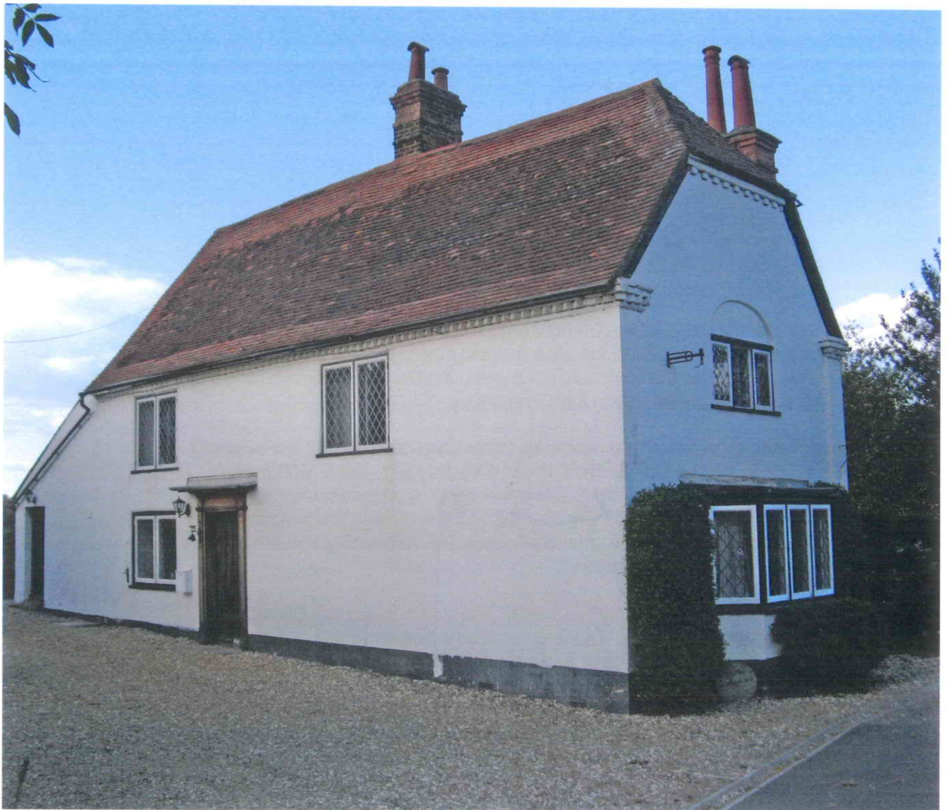
The Bull (former PH)