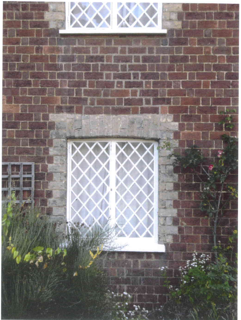
Cast-iron window detail