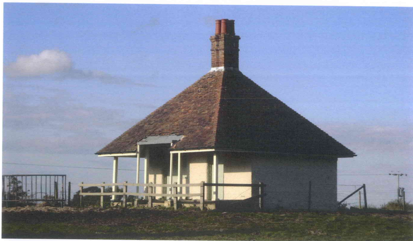
The Model Dairy