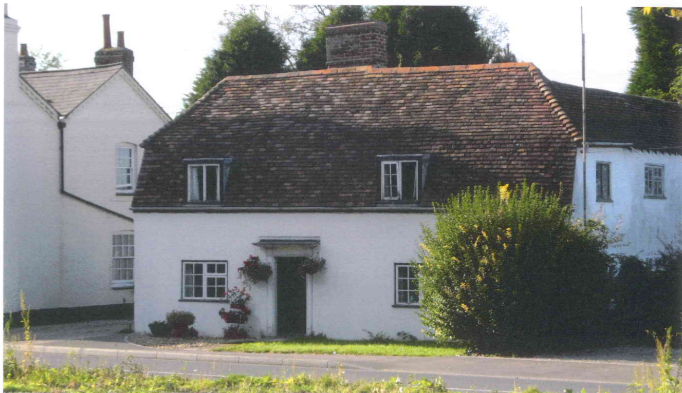
No.3 Mill Road