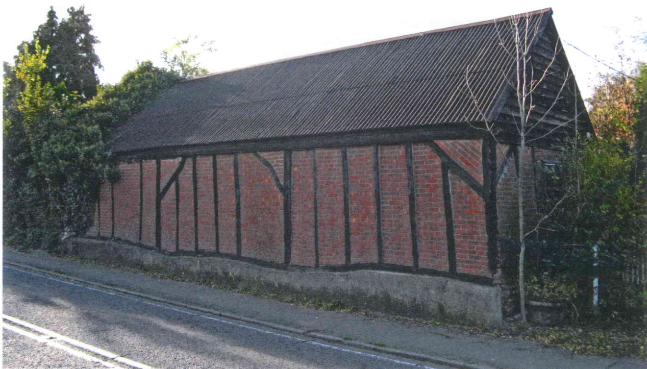
Timber framed barn at the Bakehouse