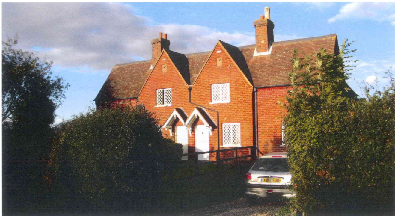
Estate Houses, Horsepool Lane