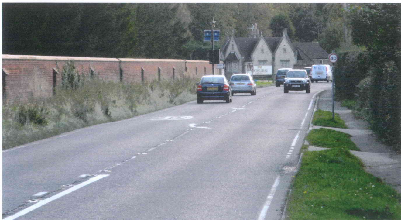
Turnpike Road looking south to Crawley Lodge