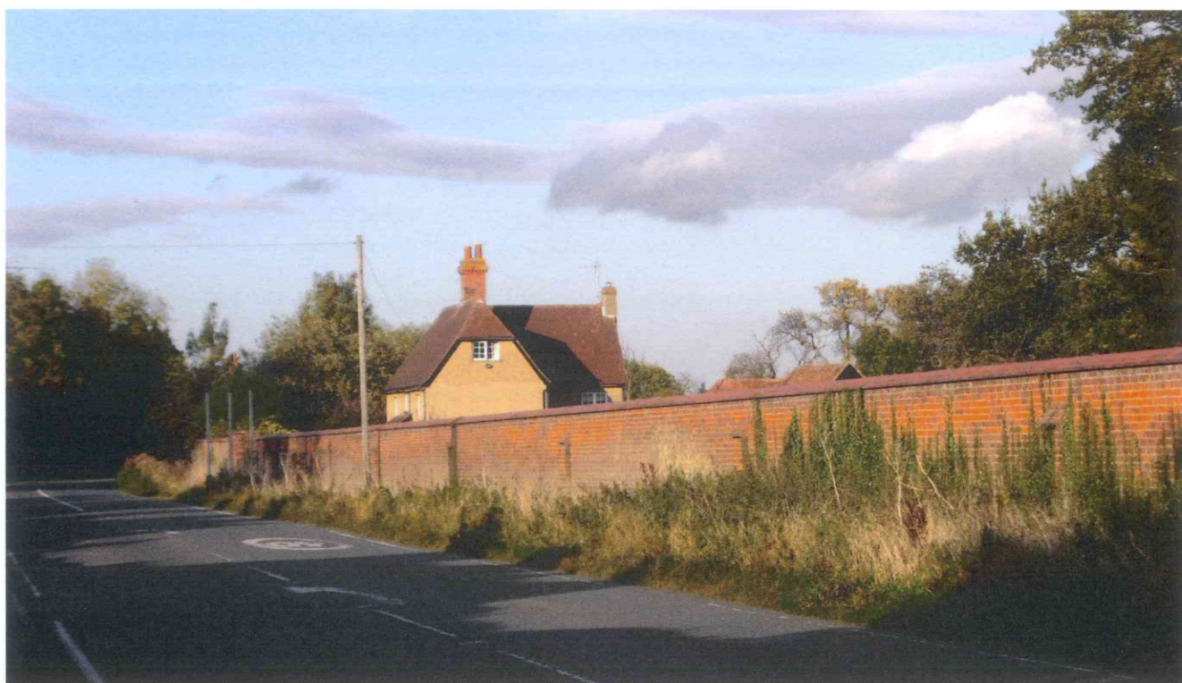
Turnpike Road looking north