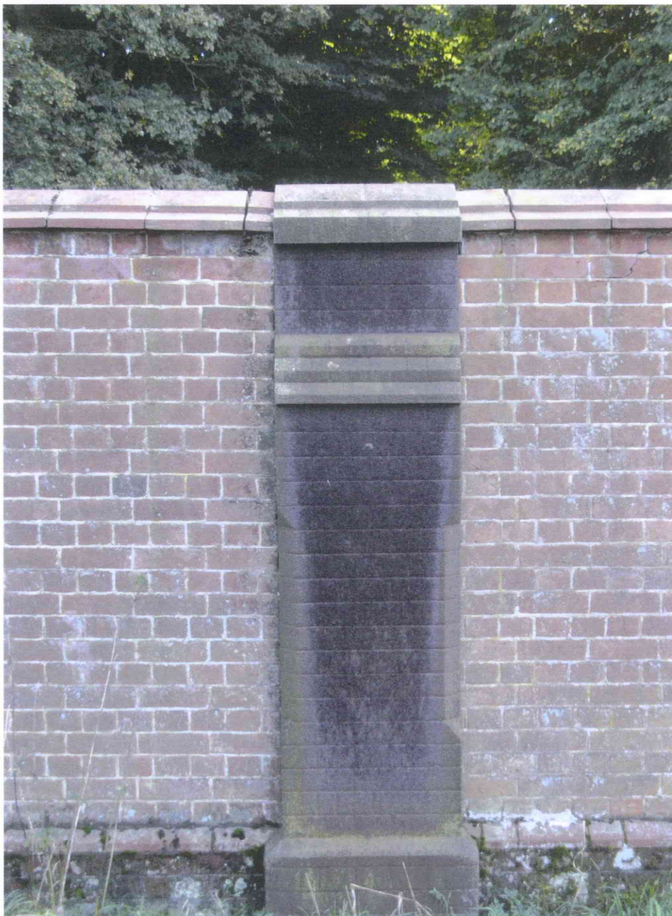
Cast-iron pier in wall to Woburn Park