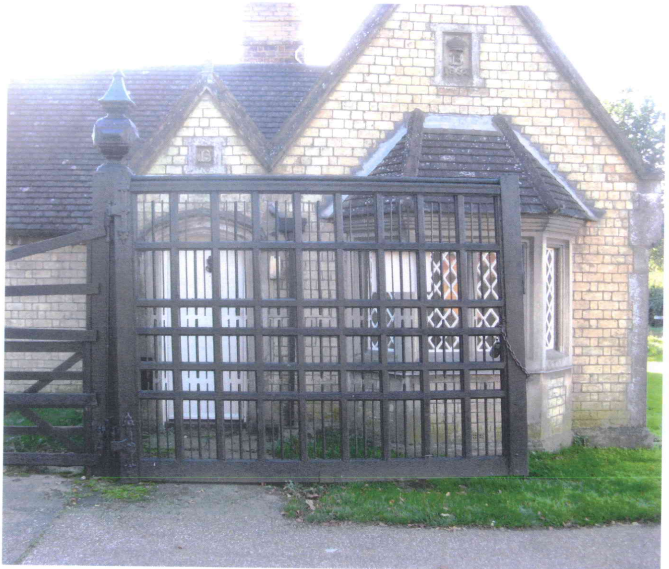
Gates at Crawley Lodge