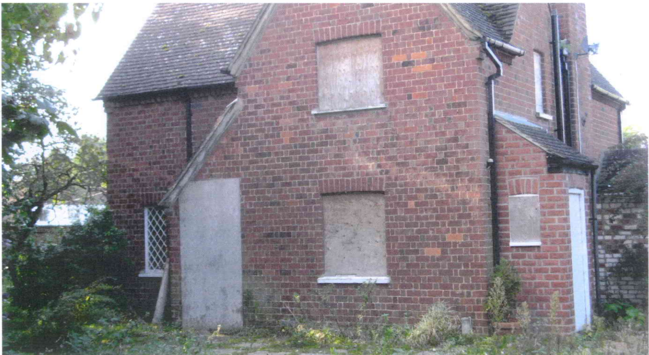
No.1 Mill Road