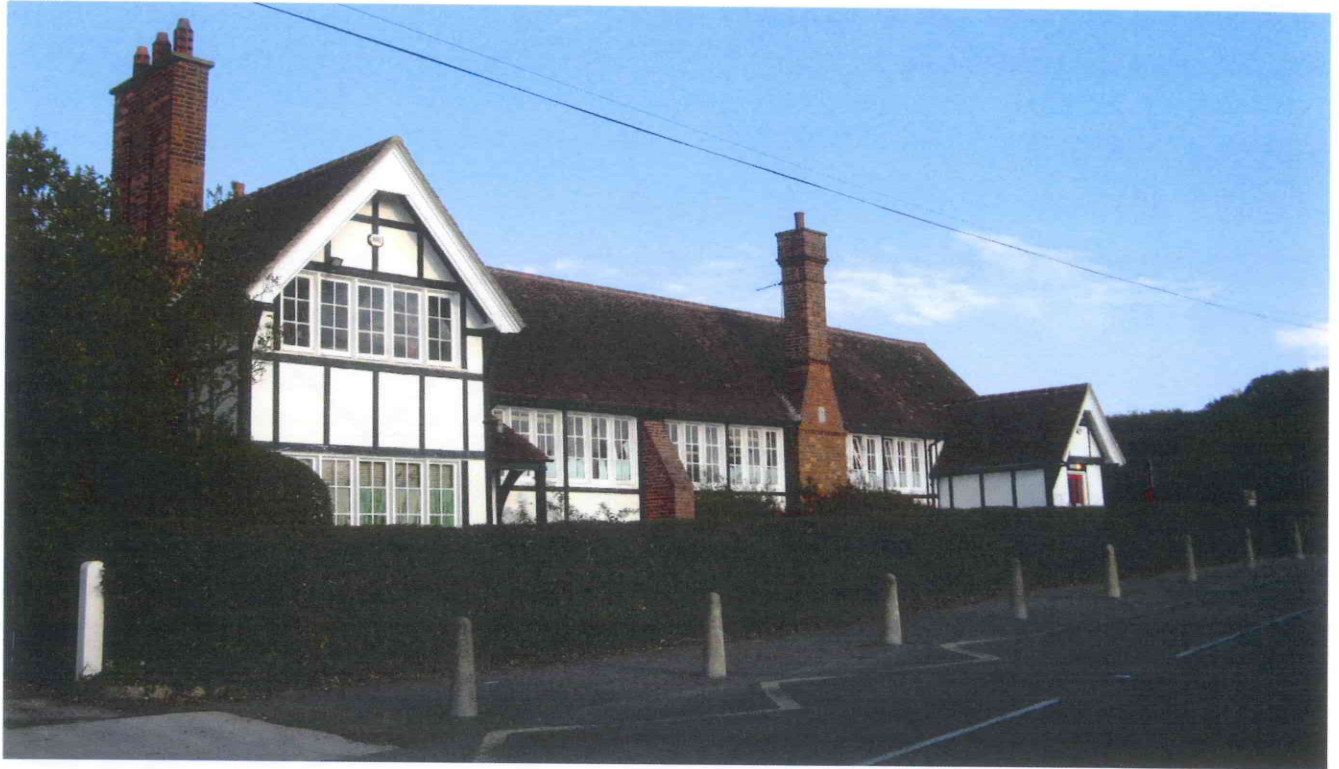
Husborne Crawley Lower School and Schoolhouse