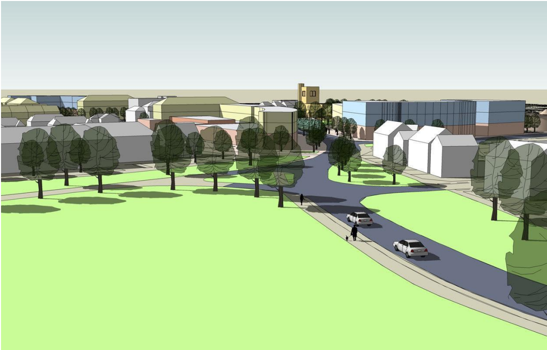
The view of the Church from The Green will be enhanced through building design and enlargement of the public realm along the High Street

All the above could be incorporated into an extensive 'outreach' programme including a media programme, school visits etc., by agreement between the Houghton Regis Town Council, the local library and Luton Museum.