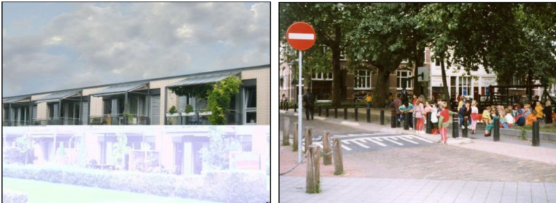
Overlooked public open space is safer and less prone to anti-social behaviour