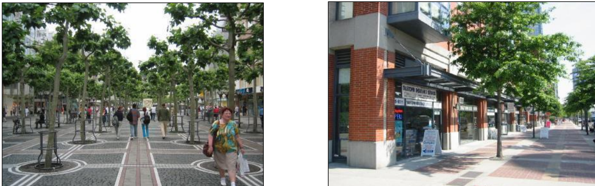
The introduction of street trees between the High Street and The Green will improve legibility, introduce visual interest, increase biodiversity and help combat pollution

Heavy traffic may preclude a shared surface treatment but crossing points could be marked by subtle lines of paving and a coordinated streetscape design will be essential to minimise signage and street furniture clutter.