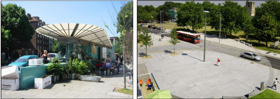
A balance between kiosks, stalls and activity and open circulation space will be made in Church Plaza

It is envisaged this will be of contemporary design and could include high quality paving, dramatic lighting, innovative street furniture, public art and water features.