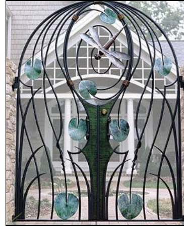
The introduction of water features can add interest to a space, while the co-ordination of entrances can link spaces together