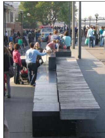
A high quality, co-ordinated approach to street furniture enhances identity and use of a space