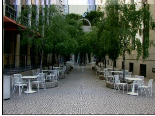
High quality materials enhance identity and enjoyment of a place