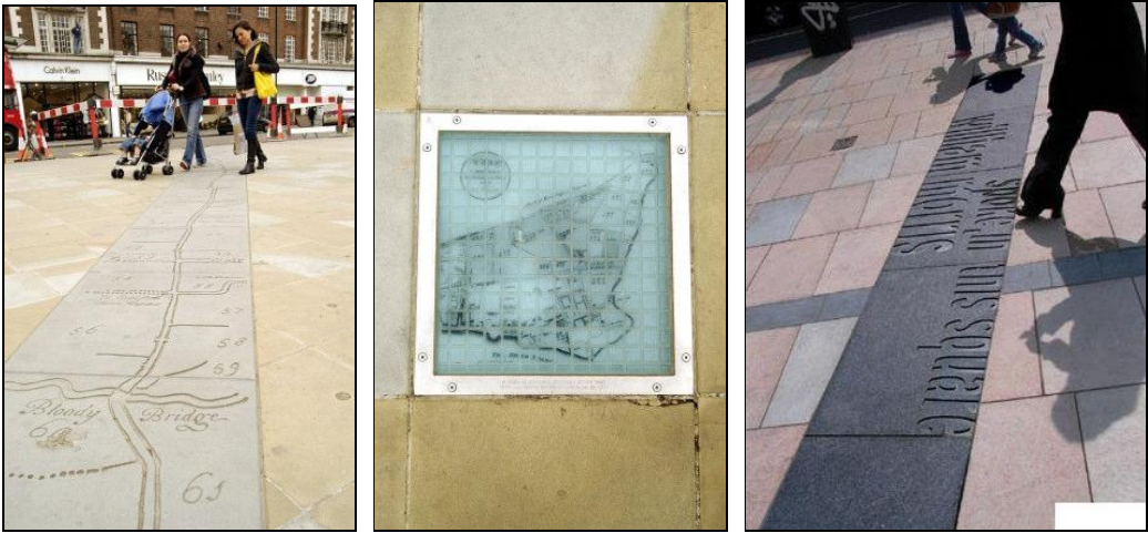
Examples of the incorporation of heritage features into an urban setting