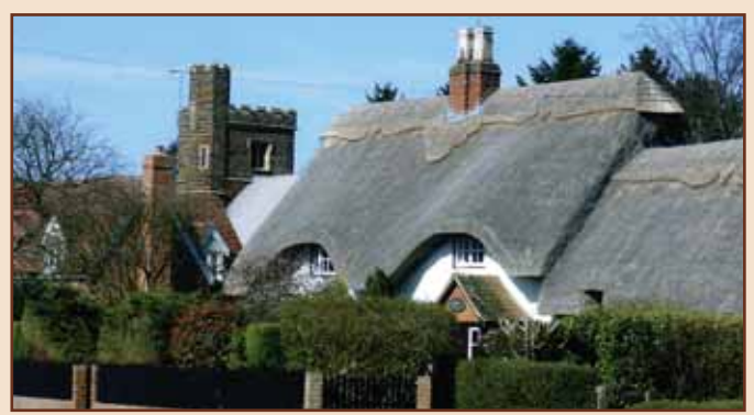
Eyebow dormers and thatch, reader, peg tile, brick and ironstone

Ironstone, the characteristic local stone of granular brown and rust colour is used, typically, for the parish church. Less typically the 'Stone Jug', a modest pub in Back Street is also built of ironstone and the old bridge, now in serious need of repair. Roofing materials are also varied. Clay plain tiles are the characteristic vernacular material and still form a main component of the village street scene. However, Welsh slate is used on Victorian buildings and for some re-roofing. Thatch roofs exist in isolated cases, usually one and a half storey cottages, notably in the Slade and Great Lane, on The Green