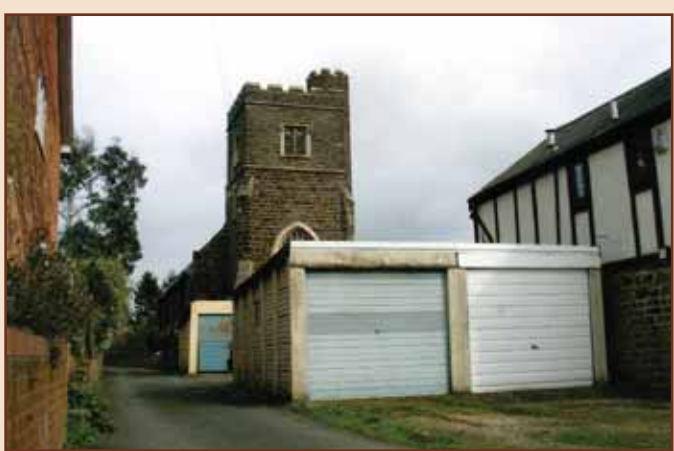
An unfortunate key view to the church tower