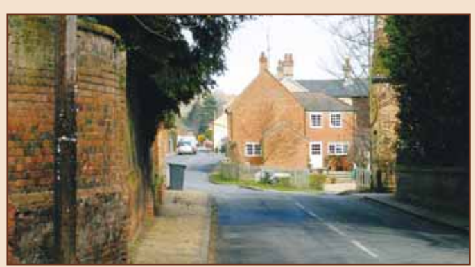
Visual enclosure of the High Street

This long street, by its subtle variation of alignment and building lines, changes in appearance and sense of enclosure. Whilst the street has been infilled with houses dating from between the post-war era and designation, which have a suburban character, they are included in some places, as they maintain the continuity of the street scene. The majority of High Street buildings and boundary walls make a positive contribution to the townscape of Clophill.