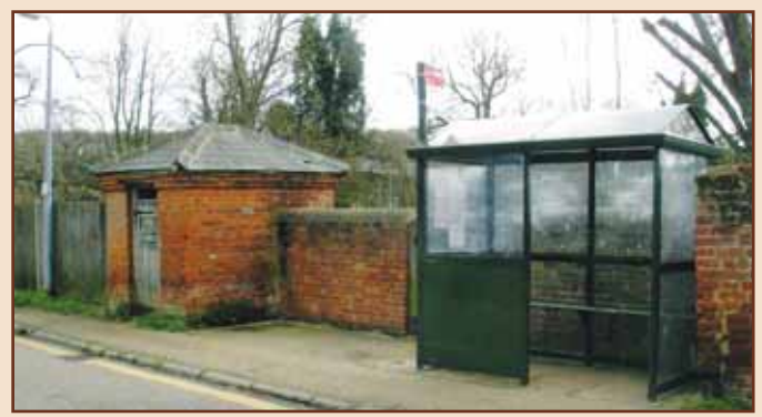
The village lock-up and a contrasting modern shelter

The view to the west of The Green at the extremity of the conservation area is terminated and enclosed by a group of tall mature trees providing a green backdrop to the view out of the conservation area. This group of trees requires some management and possibly some replanting, to maintain its dense character. The number and location of highway signs around the junctions with the A6 should be considered, in order to reduce their impact and clutter.