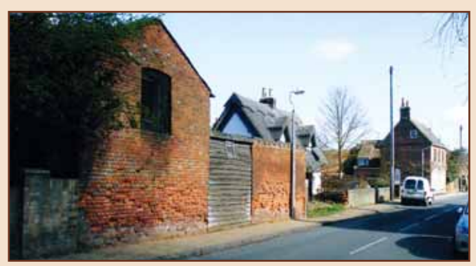
North side of the High Street weathered brick walls

The character of the development in Clophill divides into three broad types: