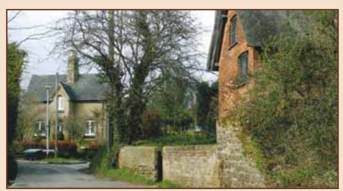
Enclosing walls and trees

Clophill has a markedly linear structure in its historic core, comprising the northeast-southwest axis of the High Street and The Green, just over one kilometre long, running parallel with the River Flit. A secondary set of routes extends to the north from Mill Lane, rising from the High Street to the lower slopes of the Greensand Ridge.