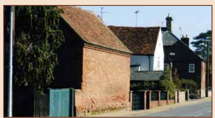
A typical range of some traditional building materials

The streetscape of the conservation area is greatly enhanced and defined by the presence of boundary walls on the back edge of the pavement or in places, the back edge of the lanes. The walls create both continuity and enclosure to streetscape, especially on the High Street and Kiln Lane, where they often link with outhouses or front garden plots and provide a setting for houses. The loss of any frontage wall would seriously detract from the character of the conservation area. The walls vary in height, style and materials, whilst retaining an overall sense of continuity. At their most formal and urbane they front Clophill House, striking wrought iron 18th-century railings. These walls are red brick, as are the majority of walls, although some more modest walls exist where gault is mixed with red brick. Significantly, there are some stretches of wall in ironstone, especially in Mill Lane, on the western edge of the village and fronting the parish church. This is a highly distinctive local resource, reflecting the fact that the material was easily and conveniently worked from the small quarries on the northern edge of the village.