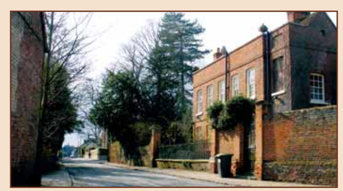
Clophill House: Formal, urbane and striking

Gault brick is used on fewer buildings, mainly Victorian, most notably the Victorian cottage terminating the view looking north up Mill Lane. This is an essay in carefully considered elevational design using polychromatic brickwork to accentuate details.