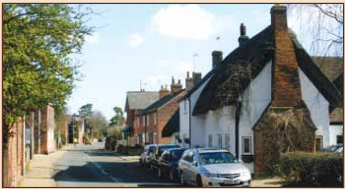
High Street looking east - varied building forms

a. High Street – relatively narrow pocket plots mainly between five and ten metres wide and considerably longer – with most extending as far as the River Flit on the south side. Buildings are usually set back by a modest amount. Some buildings, however, either as the main building or outhouse, are set at the back edge of the pavement. Exceptions are Clophill House and its neighbours, on large corner plots.