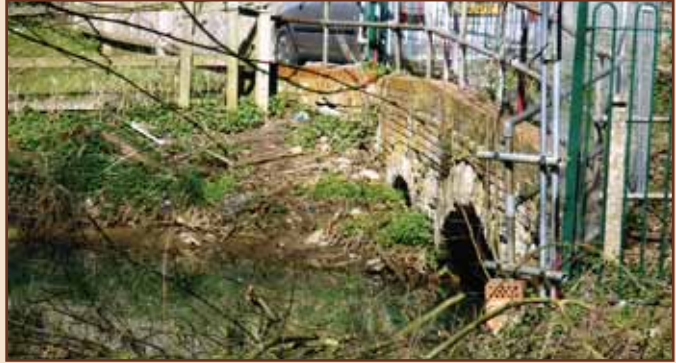
The arches of the old ironstone road bridge

Most of the southern side of The Green is relatively open, but bounded by a soft red brick wall of about 1.5 metres in height. A significant feature of this boundary is the former Pound enclosed by a brick wall, and the Parish Lock-Up. These are of considerably socio-historic interest and their appropriate maintenance is essential.