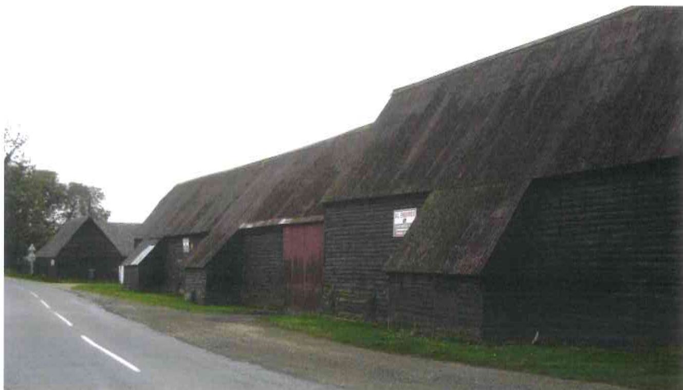
Barns at Astwick Bury