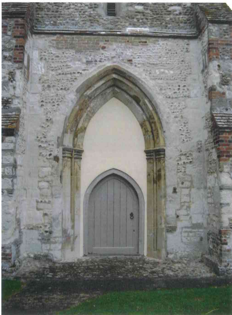
St Guthlac's Church