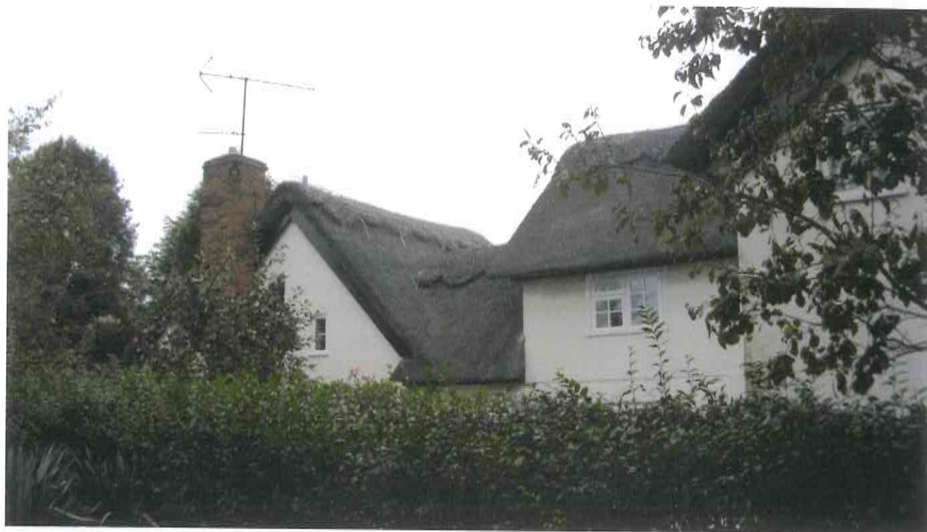
Church Farm Cottage