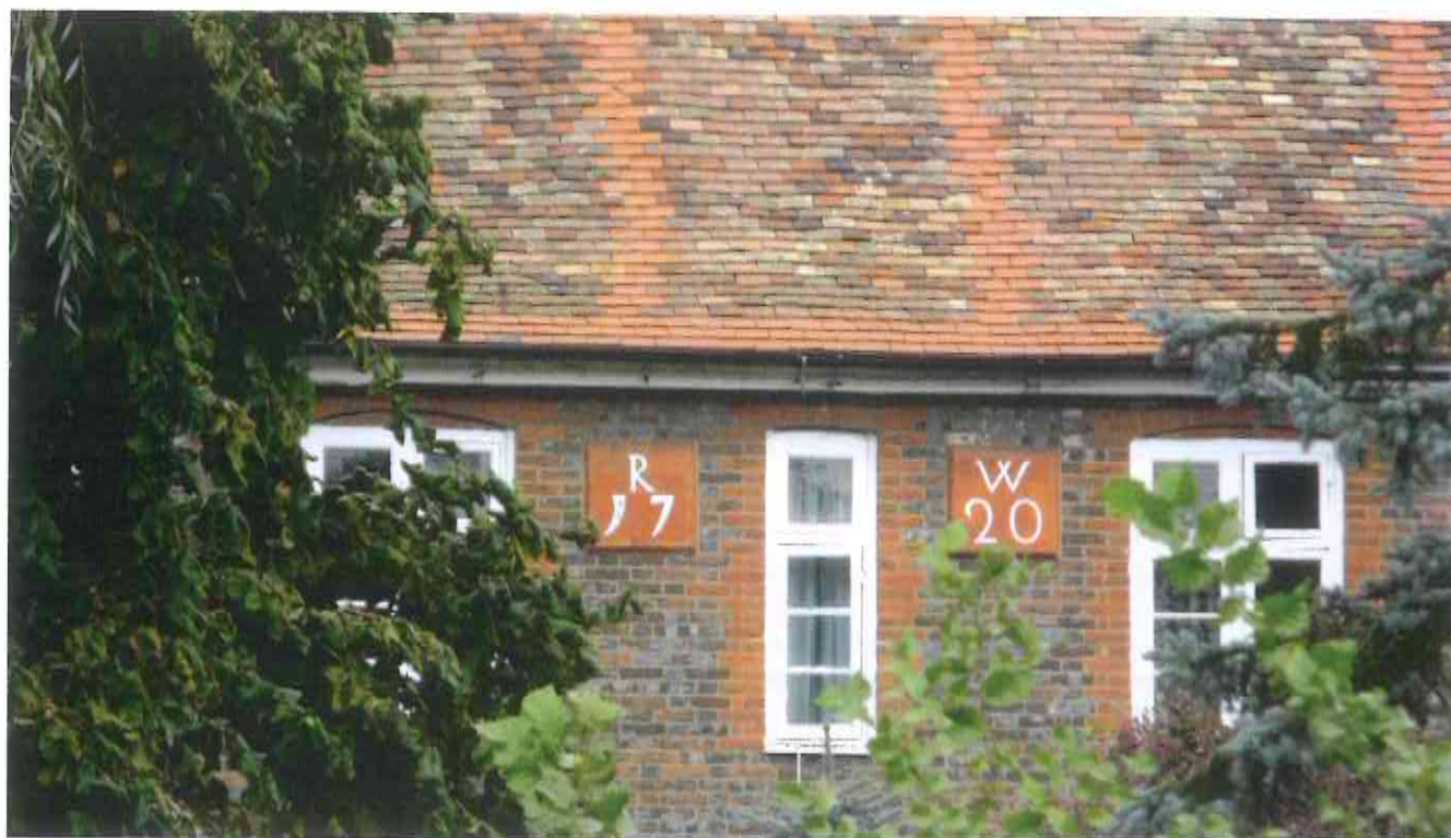
The Old Rectory