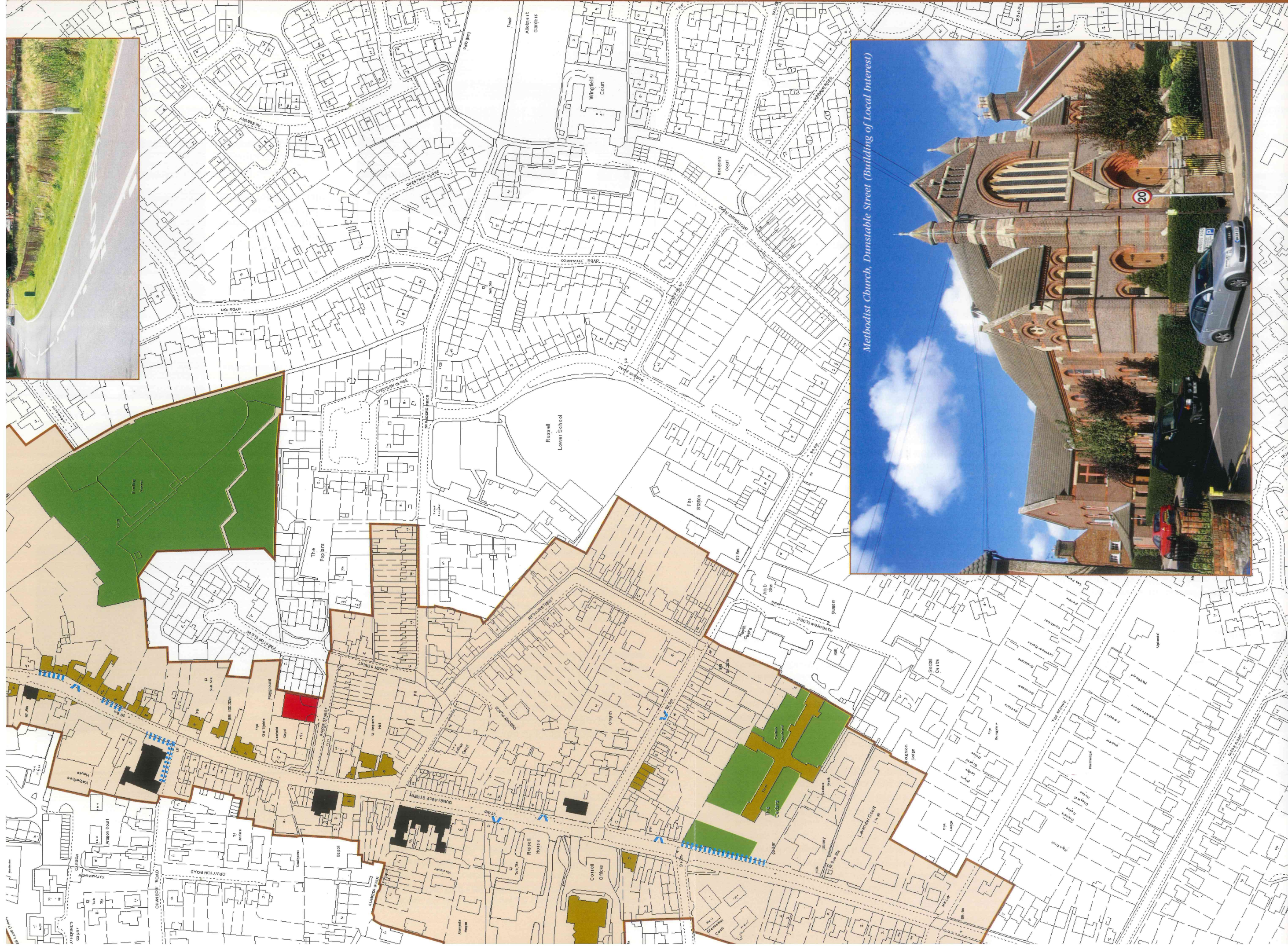
Methodist Church, Dunstable Street (Building of Local Interest)