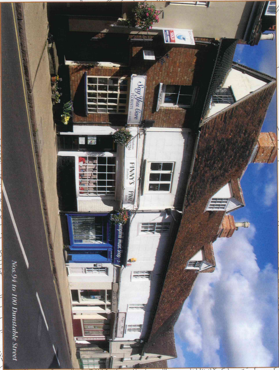
Nos 94 to 100 Dunsdale Street