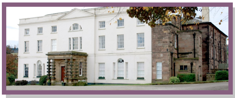
Alderwasley Hall School