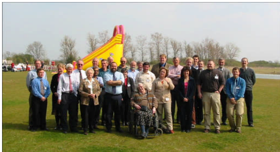
First Joint Local Access Forum meeting 12 th April 2003