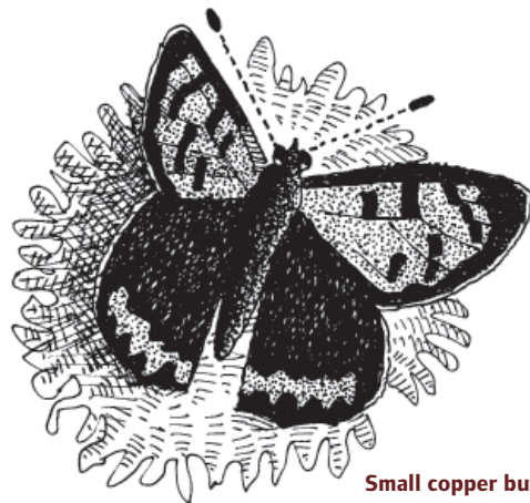
Small copper butterfly