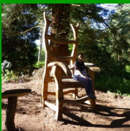
Large carved chair at Rushmere Park