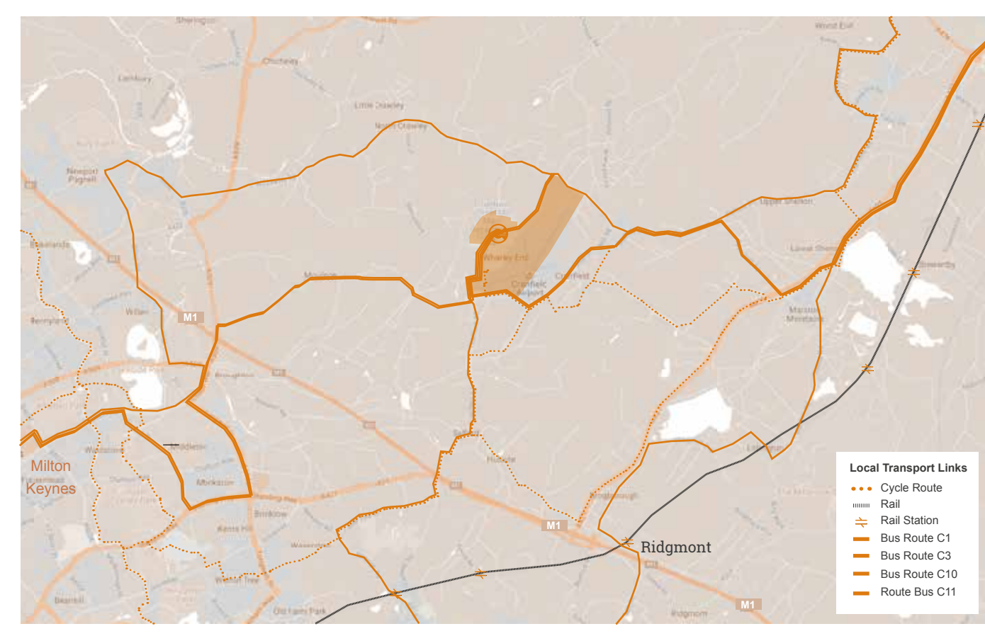
Cranfield University local transportation connections

Airport – an important and unique facility within the higher education sector, the Cranfield Airport provides a base for the National Flying Laboratory Centre which is directly supported by HEFCE. The Airport also features an Airpark for related business opportunities. The Airport is not the focus of this Masterplan, however its future potential is being looked at as part of a separate exercise. Any proposals for the development of the Airport will be brought forward separately, reviewing how its commercial opportunities and position in the south east can be exploited.