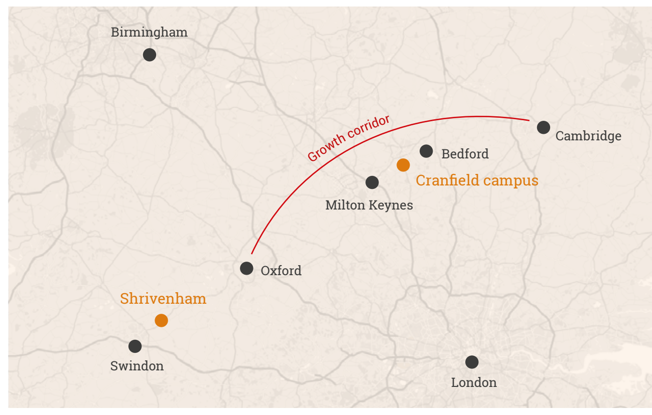
Cranfield University sites

The entire Cranfield campus covers a site of 250 hectares currently accommodating approximately 150,000m<sup>2</sup> of floorspace, consisting of academic, administrative and non-domestic buildings together with on-campus student accommodation.