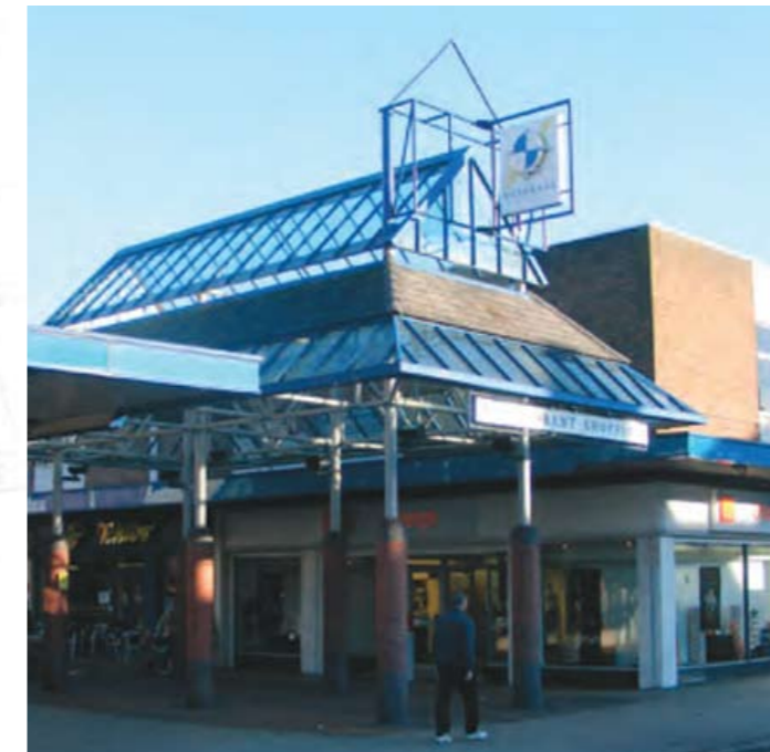
The Quadrant Shopping Centre and the market at Ashton Square in Dunstable