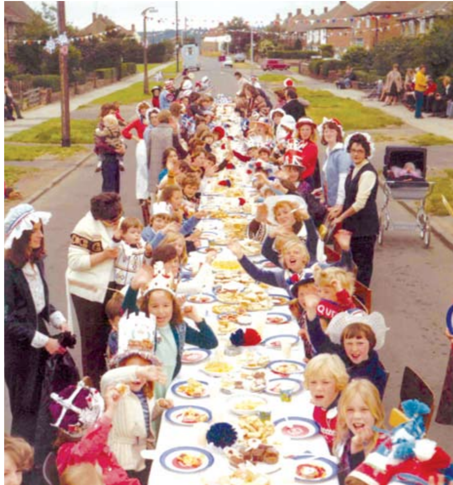
Revellers in Biggleswade enjoyed the 1977 Silver Jubilee, why not do the same?

This is great news for residents as it means that all agreed road closures will be free of charge,