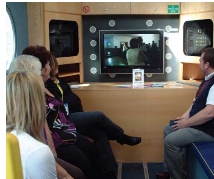
Above: The bus offers fully interactive services for residents