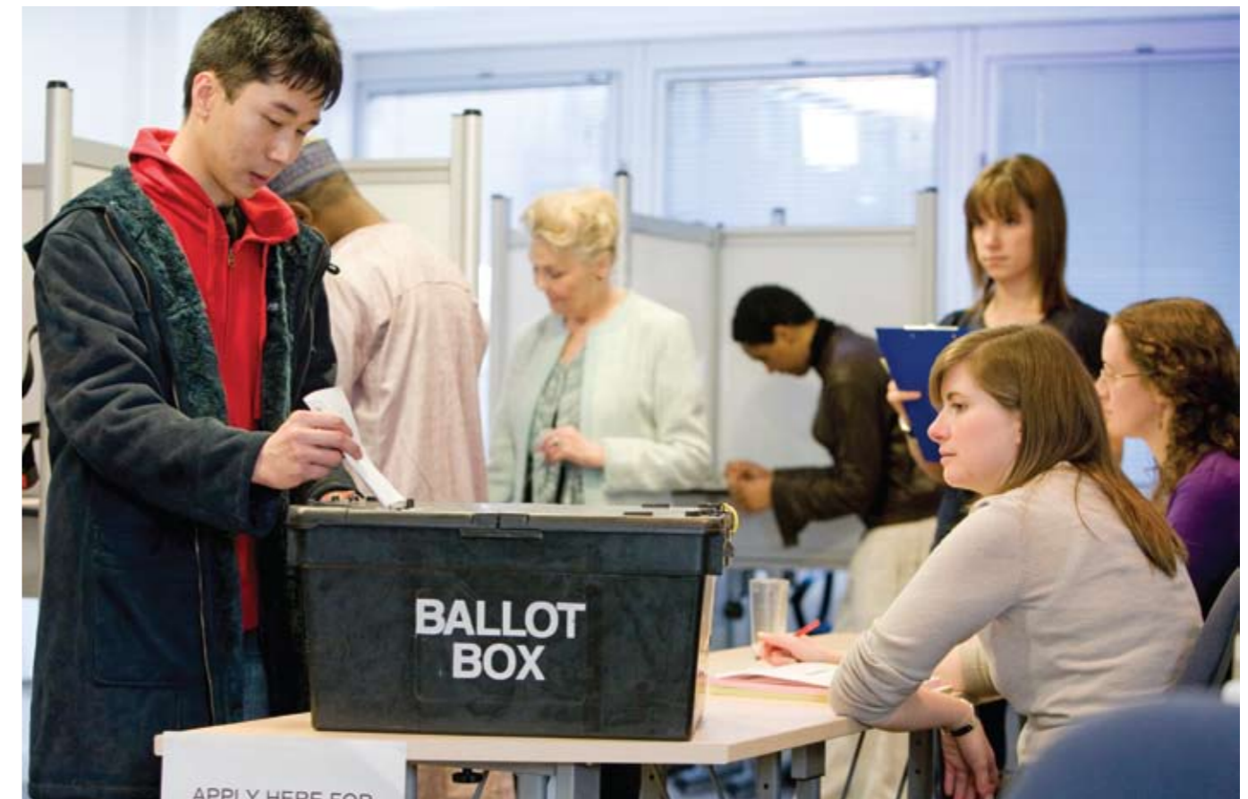
Don't miss out on your opportunity to vote and have a say on local issues

If you want to vote in person we will send out poll cards at the end of March telling you which polling station you should vote at. You do not need your poll card to be able to vote.