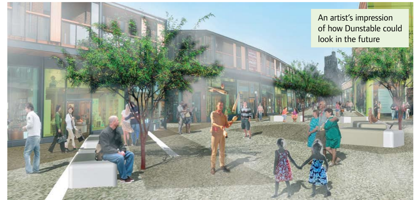
An artist's impression of how Dunstable could look in the future

During 2011 Central Bedfordshire Council is looking to finalise a number of plans which will guide big town centre developments that will cater for our rapidly expanding area. Once agreed the plans will be formally adopted by Central Bedfordshire Council as planning policies. These will guide discussions with developers and ultimately the determination of planning applications relating to the town centres.