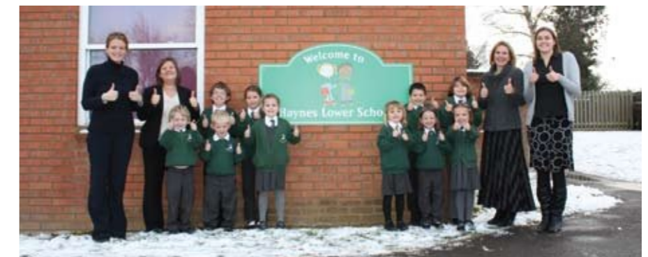
Staff and pupils at Haynes Lower School were delighted to attain an outstanding Ofsted inspection recently. Thumbs up to them!

Work is well underway to relocate and expand Roecroft Lower School, Stotfold to a new site south of town