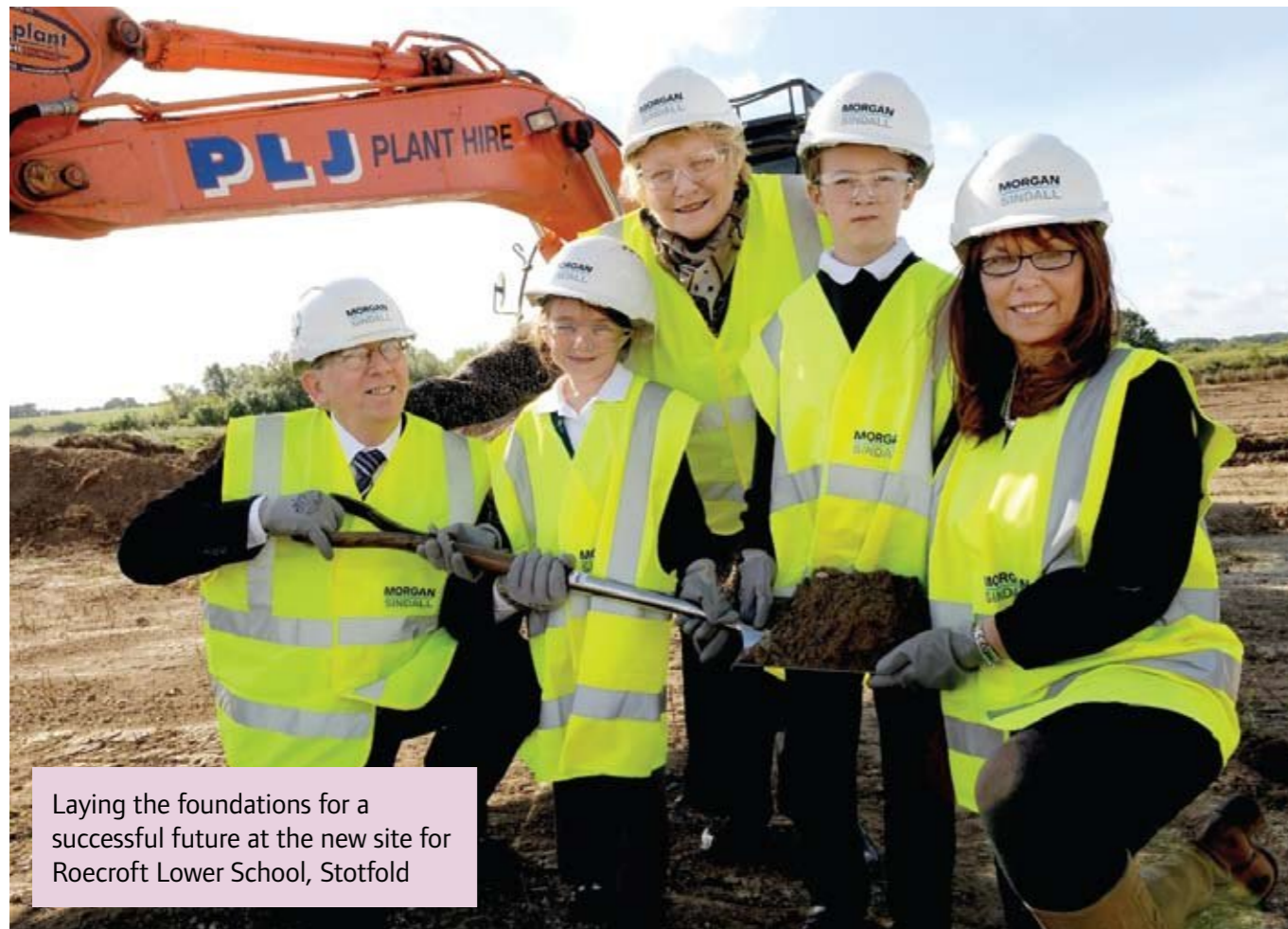
Laying the foundations for a successful future at the new site for Roecroft Lower School, Stotfold