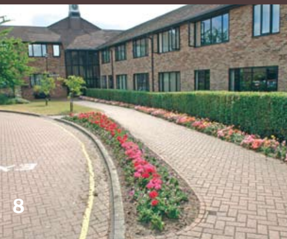
(From left to right) Scenes from Flitwick and the surrounding area: The Rufus Centre, skate park, wild garlic in Flitwick Woods, the war memorial in the town centre and 'natural play' activities at Flitwick Manor

A new leaflet about Flitwick and surrounding areas is available from the town council. Call 01525 631900, email info@flitwick.gov.uk , or visit www.flitwick.gov.uk