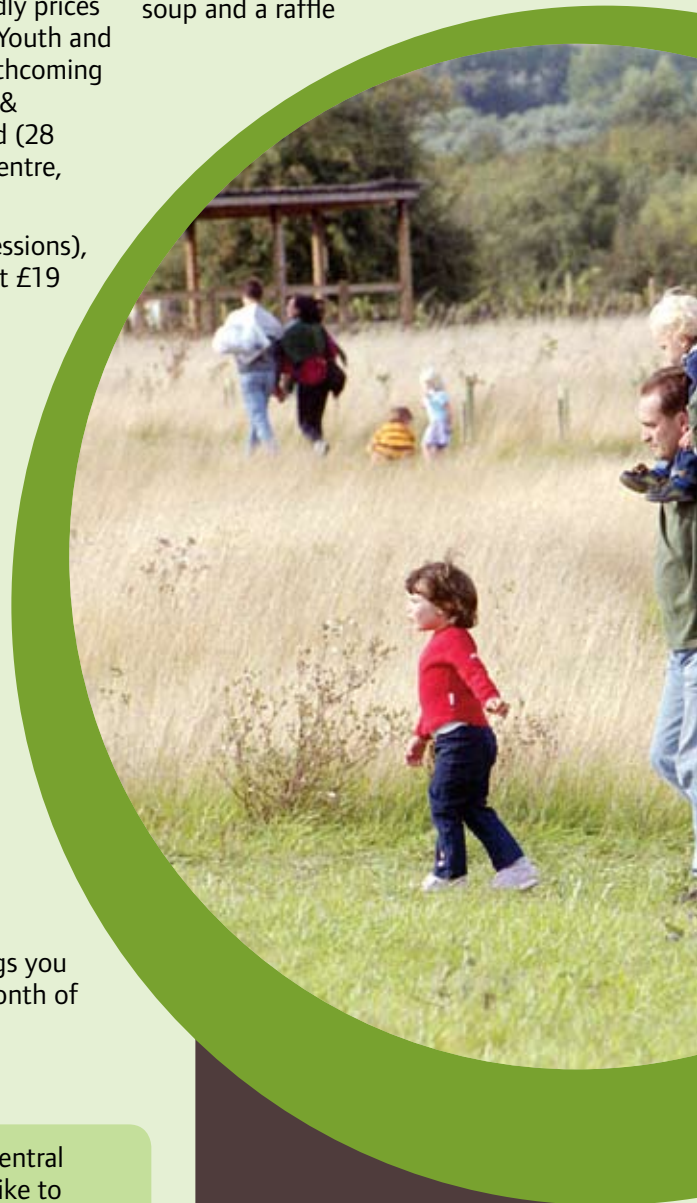
Families enjoy a walk at the Forest of Marston Vale

Huge selection of second-hand books, refreshments, homemade soup and a raffle