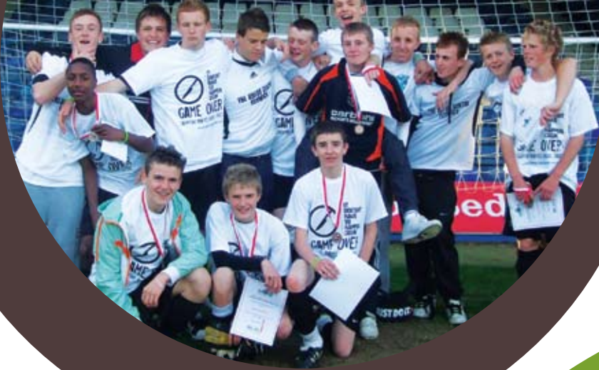
Local teenagers from the 'No More Knives' football group in Flitwick